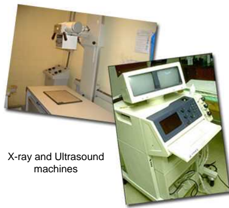
X-ray and Ultrasound machines

The histopathology report typically includes additional information that helps to indicate how the cancer is likely to behave. Diagnosis of lymph cancers can be difficult and some types of hyperplasia progress to neoplasia (cancer).