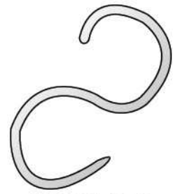
Roundworm (2x actual size)

Unfortunately, the majority of preparations available today kill only the adult worms and do not affect migrating or encysting larvae. It is therefore important that repeated treatments are administered. Your veterinarian will advise you on the best treatment and prevention plan for your pet.