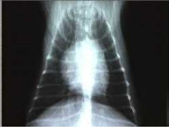
Chest X-Ray – Normal Heart

Angiotensin Converting Enzyme (ACE) inhibitors – ACE-inhibitors work by lowering blood pressure and reducing the after-load or resistance to blood flowing out of the heart. They are one of the most powerful and commonly used classes of drugs for heart disease in both humans and pets. ACE-inhibitors are the only drugs proven to extend life expectancy in both people and dogs. Enalapril and benazepril are commonly used ACE-inhibitors in dogs.