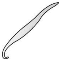
Hookworm (5x actual size)

Since the dog's environment can be infested with hookworm eggs and larvae, it may be necessary to treat with chemicals to remove them from your yard. We can offer recommendations for grass-friendly products.